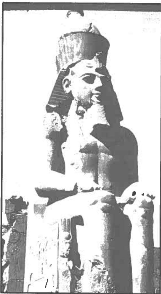
Statue of Ramses II, Luxor